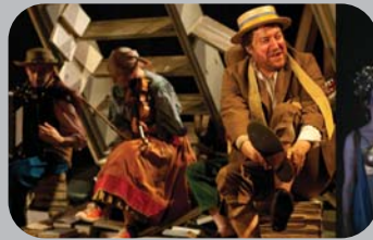
The Winter's Tale