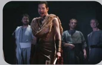
Julius Caesar