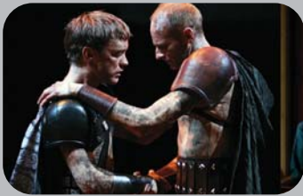
Julius Caesar